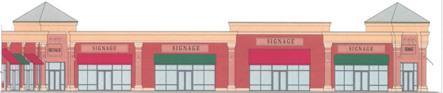
PROPOSED WEST ELEVATION NOT TO SCALE